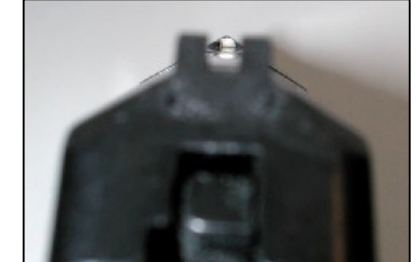
Sight picture with P-Sight<sup>™</sup> installed.

11. Congratulations! Your P-Sight<sup>TM</sup> is now installed. You may carry your pistol normally. However, unless needed for self-defense, you should wait 5 days before firing it, which is the manufacturer's recommended time for allowing the adhesive to fully cure. While the P-Sight<sup>TM</sup> and adhesive are resistant to most solvents, do not excessively expose it to solvents while cleaning your pistol. Prolonged exposure may weaken the adhesive. ALWAYS WEAR EYE AND EAR PROTECTION WHEN SHOOTING YOUR PISTOL!