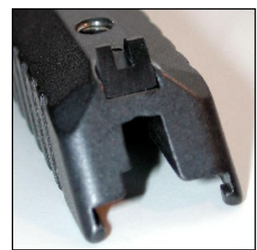
Figure 2. Proper fit.