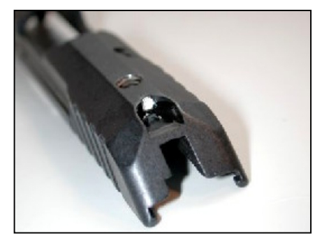
Figure 6. Ready to install P-Sight<sup>™</sup>.